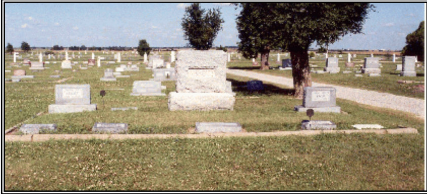
Abbott Cemetery Plot, Newkirk, Oklahoma